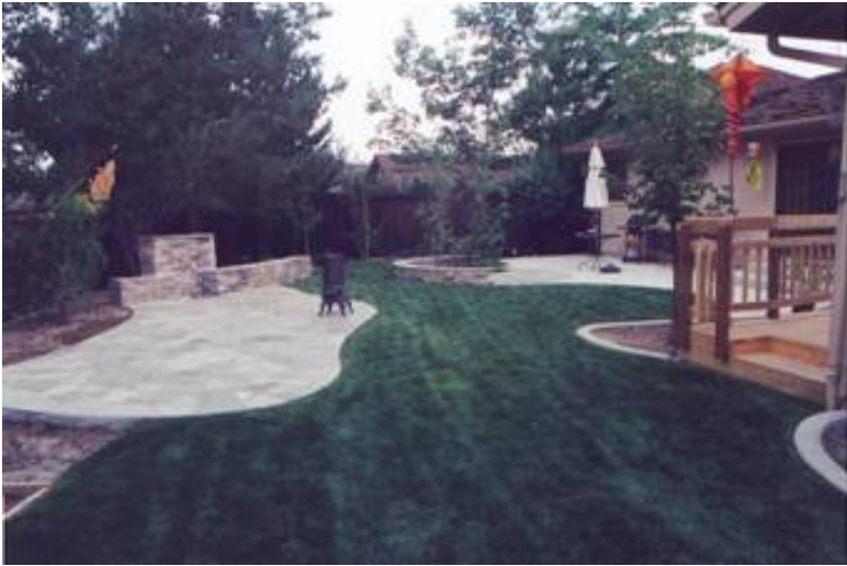
Figure 1. The above EPIC backyard provides 100% efficient irrigation and total storm water capture

The non-pressurized system changed the first cardinal rule that irrigation water has to be pressurized and of drinking water quality. Irrigation could now be achieved with a number of water sources without any public health concerns. Domestic water, shower water reuse, and reclaimed water from sewage treatment plants could all be blended and be reused even in a residential settings without any public health issues. However easier and more importantly, the EPIC system opened the doors for efficient capture and reuse of storm water directly. The system acted as a pre-filter for runoff sources prior to storage and then flipped as an efficient irrigation system during dry periods.