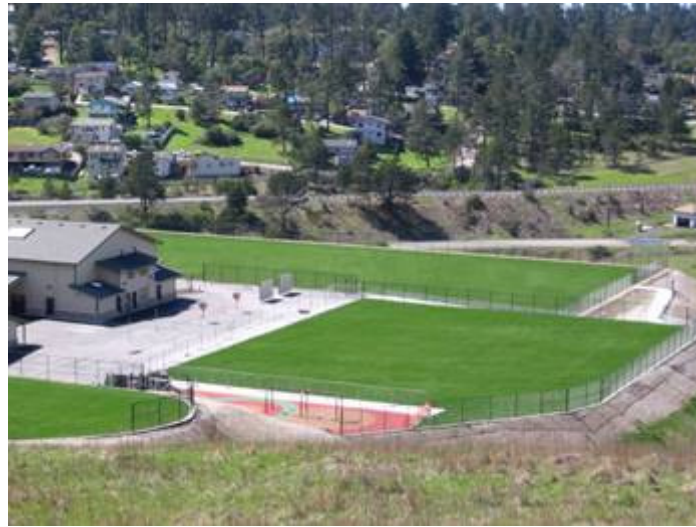
Figure 2. Cambria Elementary School, California

Most of the public does not realize that a one acre lot of hardscape produces 189,000 gallons of water in a 7” rainfall climate per year. This is enough irrigation water to sustain a landscape area of 4000 sq. ft. a full year.